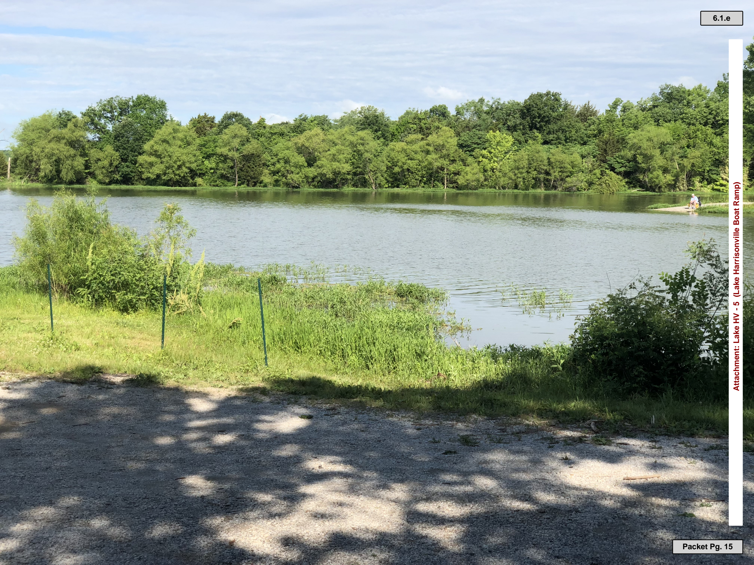
Attachment: Lake HV - 5 (Lake Harrisonville Boat Ramp)