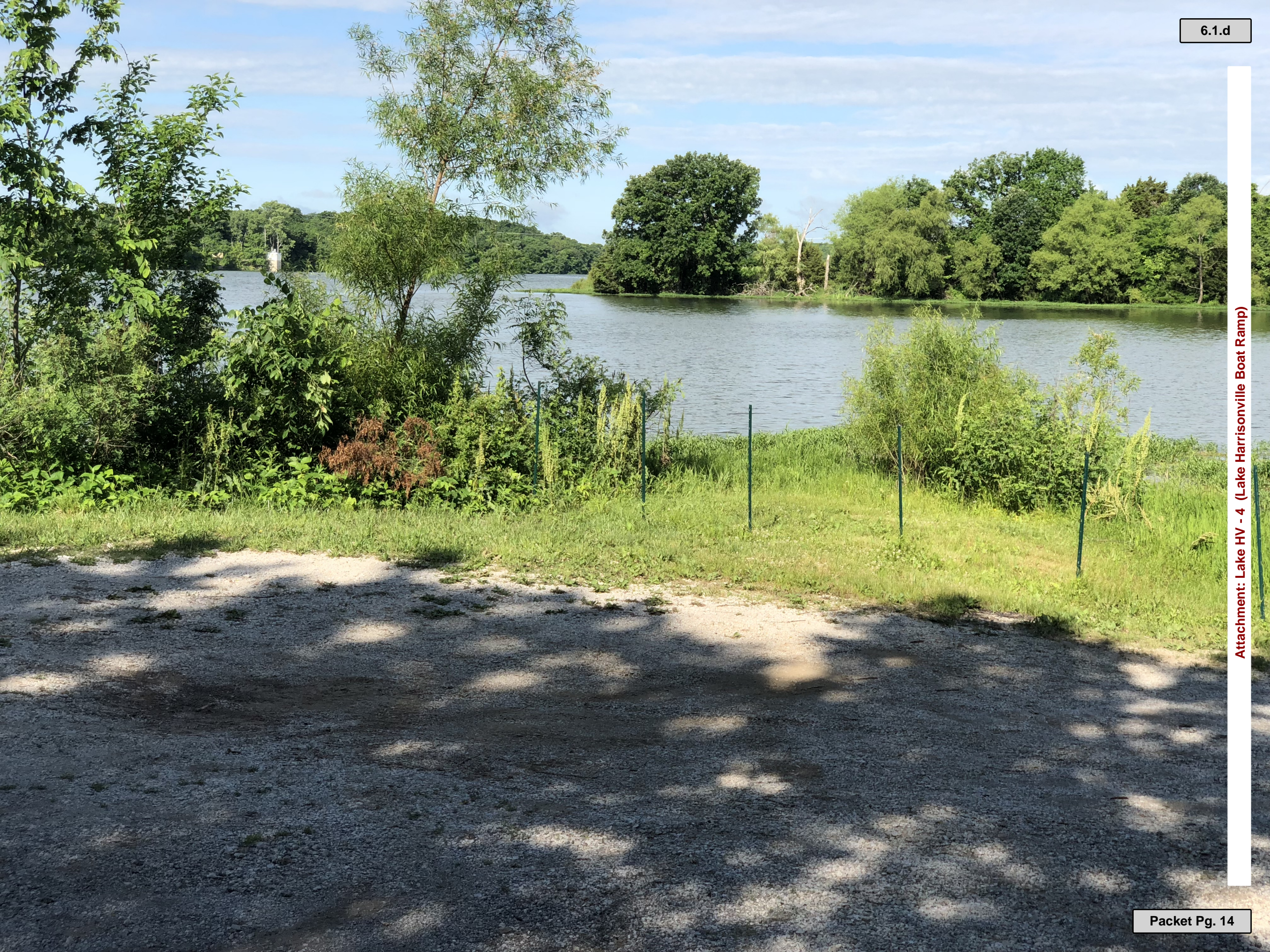
Attachment: Lake HV - 4 (Lake Harrisonville Boat Ramp)