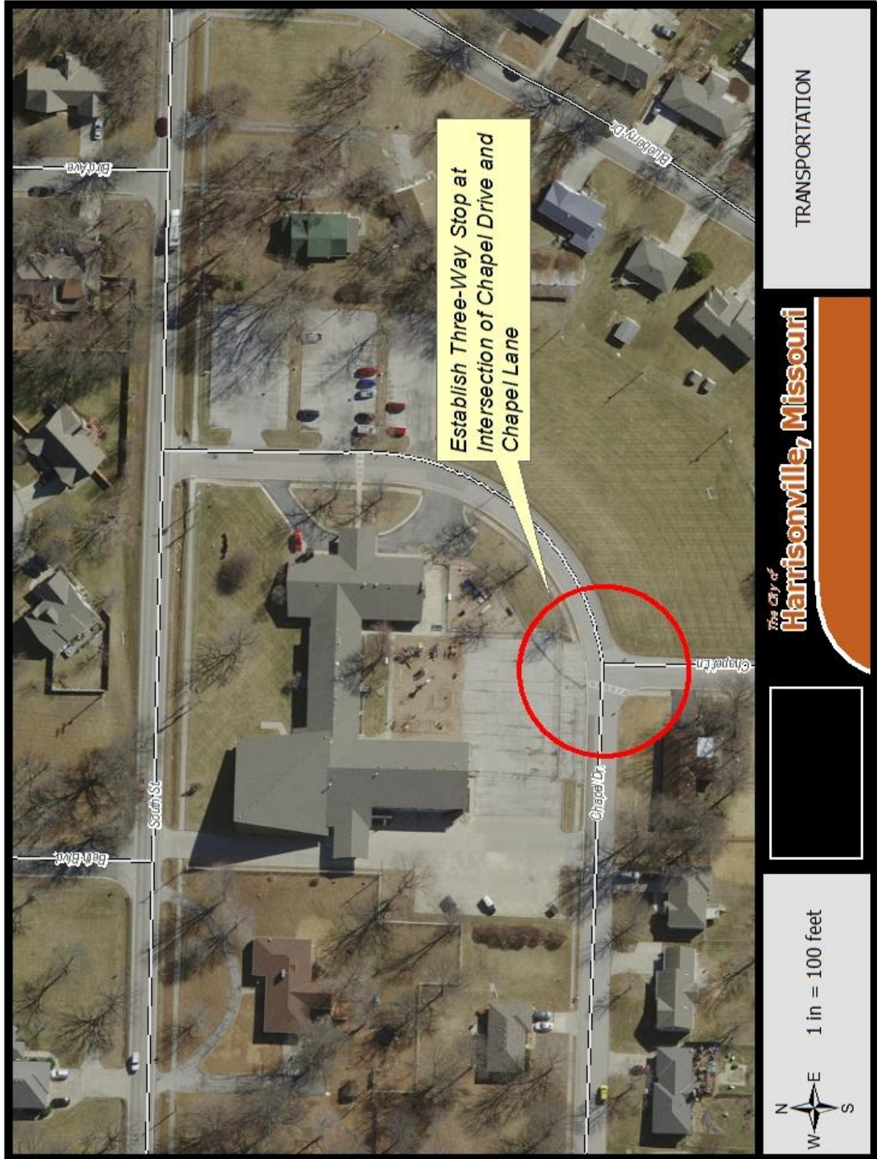
Attachment: BOA Memo 3 Way Stop at Chapel Dr and Chapel Ln Intersection (Three-way Stop at Chapel Drive and Chapel Lane)